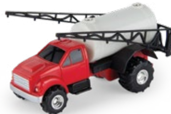
1:64 Sprayer Truck Part No. ZFN47494 Case Pack: 6 – Age grade 3+