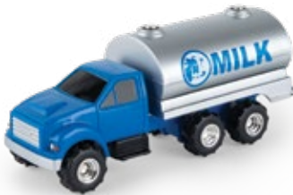
1:64 Milk Truck Part No. ZFN47493 Case Pack: 6 – Age grade 3+