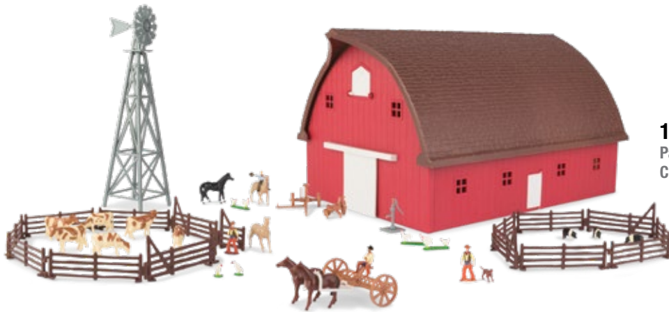
1:64 Farm Country Gable Barn Part No. ZFN46765 Case Pack: 2 – Age grade 5+