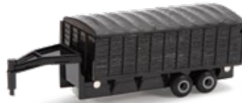
1:64 Grain Trailer Part No. ZFN46594 Case Pack: 8 – Age grade 3+