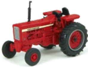
1:64 International Vintage Tractor Part No. ZFN46573 Case Pack: 12 – Age grade 3+