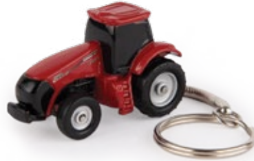
Case IH Magnum™ 380 Keychain Part No. ZFN44204 Case Pack: 96 – Age grade 8+