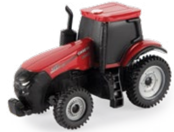
1:64 Case IH AFS Connect™ Magnum™ 380 Part No. ZFN47166 Case Pack: 4 – Age grade: 3+