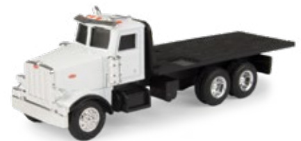
1:64 Peterbilt Flatbed Truck Part No. ZFN46709 Case Pack: 4 – Age grade 3+