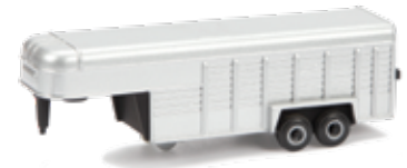
1:64 Livestock Trailer Part No. ZFN46593 Case Pack: 8 – Age grade 3+