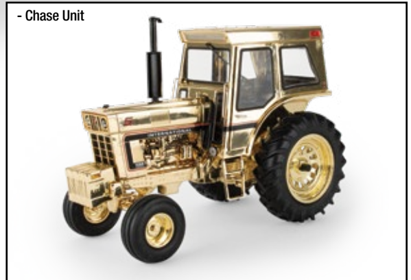
- Chase Unit

February 1st, 1974 was a key milestone for IHC. It was the release date of the model 1066 commemorative five millionth tractor. Celebrating 50 years since that release, this tractor features die-cast construction, opening doors, steerable front wheels, movable rear 3-point hitch and highly detailed interior. One time production; while supplies last.