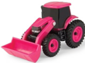
1:64 Pink Loader Tractor Part No. ZFN46705 Case Pack: 8 – Age grade 3+