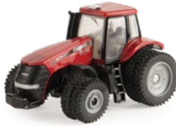
1:64 Case IH Modern Tractor Part No. ZFN46502 Case Pack: 4 – Age grade 3+