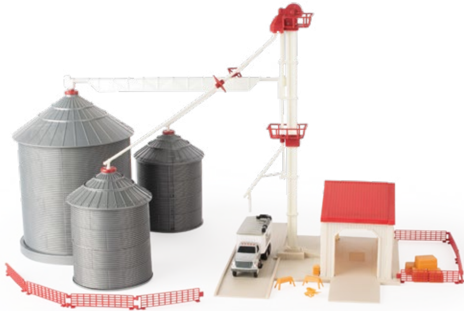
1:64 Grain Elevator Set Part No. ZFN12924 Case Pack: 4 – Age grade 5+ - While supplies last