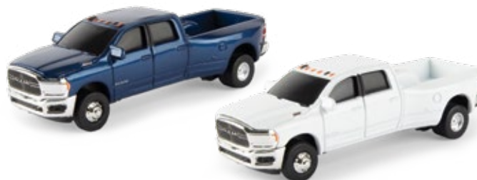
1:64 2020 Ram® Big Horn® Pickup Assortment Part No. ZFN47169 Case Pack: 12 – Age grade 3+